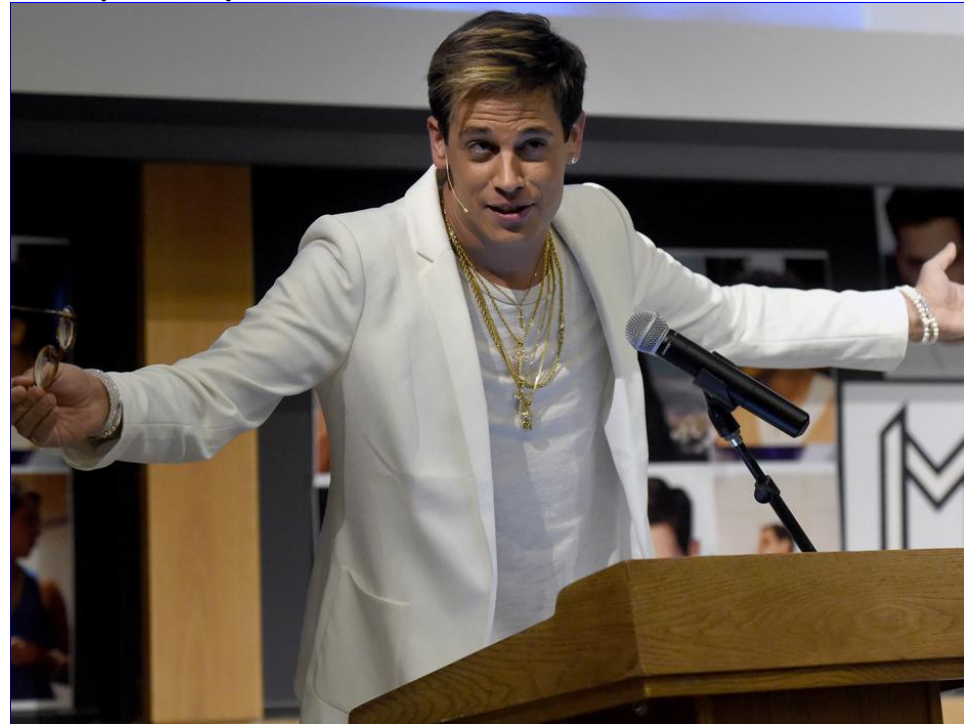
Milo Yiannopoulos, the Breitbart editor known for inflammatory remarks about women and Muslims, speaks on campus at the University of Colorado in Boulder, Colo. Jan. 25, 2017.

Freedom for Individual Rights in Education (FIRE) is an organization that defends freedom of speech for students and academics at American universities. They've tracked disinvitations and speech disruptions on campus over the last 17 years and recently published their findings.