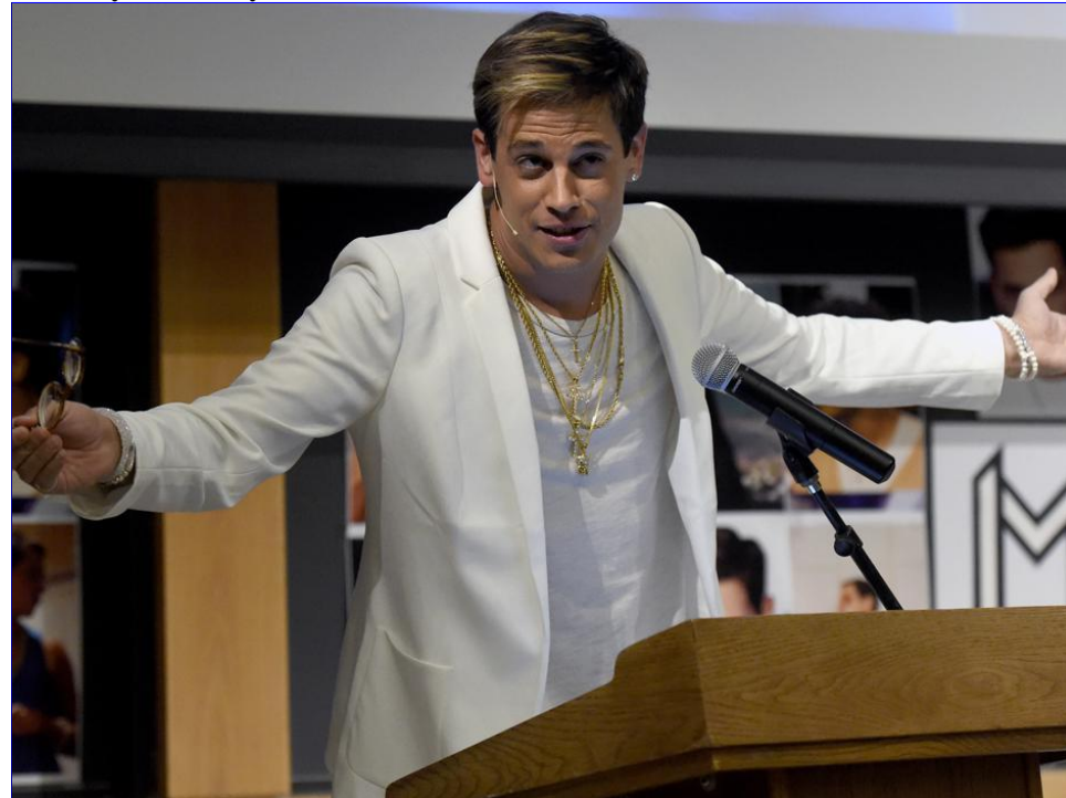
Milo Yiannopoulos, the Breitbart editor known for inflammatory remarks about women and Muslims, speaks on campus at the University of Colorado in Boulder, Colo. Jan. 25, 2017.

Freedom for Individual Rights in Education (FIRE) is an organization that defends freedom of speech for students and academics at American universities. They've tracked disinvitations and speech disruptions on campus over the last 17 years and recently published their findings.